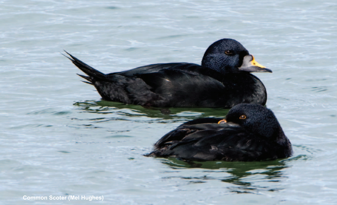
Common Scoter (Mel Hughes)

Flints. There was a large increase in numbers at sites along the open coast in Mar. The maximum count of the year occurred to the E of the Point of Ayr with an impressive 20,000 on 12/03 (GR). There were other counts from here but only up to 250 birds earlier in the winter. Elsewhere records included: 3,000 off Rhyl on 25/03, falling to 250 by 8/04 (AHJ) and 70 at Gronant on 12/03 (PMi). A record of 100 at RSPB Oakenholt Marsh on 5/10 (PSH) was a particularly high count this far up the Dee estuary with a single further upstream at Connah's Quay Bridge on 8/03 (GRMP) and Connah's Quay NR on 4/11 (PDS).